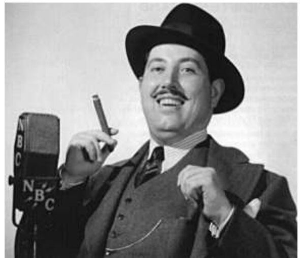
The Great Guildersleeve