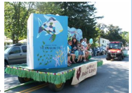
The 2010 Library Memorial Day Float designed, built, and operated by volunteers.

Please join us for refreshments and celebrations while viewing our collection, technology and services offerings.